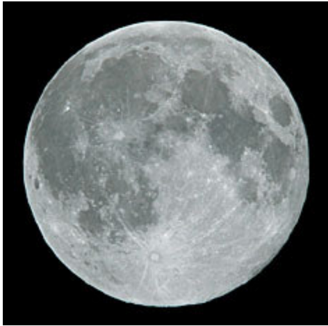
Many Lunar 100 selections are plainly visible in this image of the full Moon, while others require a more detailed view, different illumination, or favorable libration. North is up. S&T: Gary Seronik

Just about every telescope user is familiar with French comet hunter Charles Messier's catalog of fuzzy objects. Messier's 18th-century listing of 109 galaxies, clusters, and nebulae contains some of the largest, brightest, and most visually interesting deep-sky treasures visible from the Northern Hemisphere. Little wonder that observing all the M objects is regarded as a virtual rite of passage for amateur astronomers.